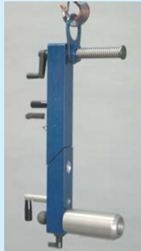
Shown with 3" LC Mandrel

LIFT · TURN · TRANSPORT · LOAD · UNLOAD · STACK · STORE · PACKAGE · PALLETIZE