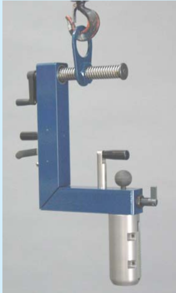
Shown with 3" LC Mandrel

LIFT · TURN · TRANSPORT · LOAD · UNLOAD · STACK · STORE · PACKAGE · PALLETIZE